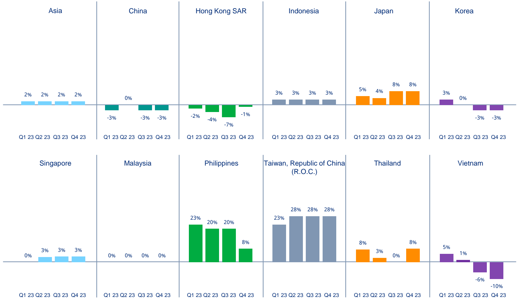
Figure 2| Asia property insurance pricing change by market

Property insurance rates rose 2%, the same as in the prior quarter.