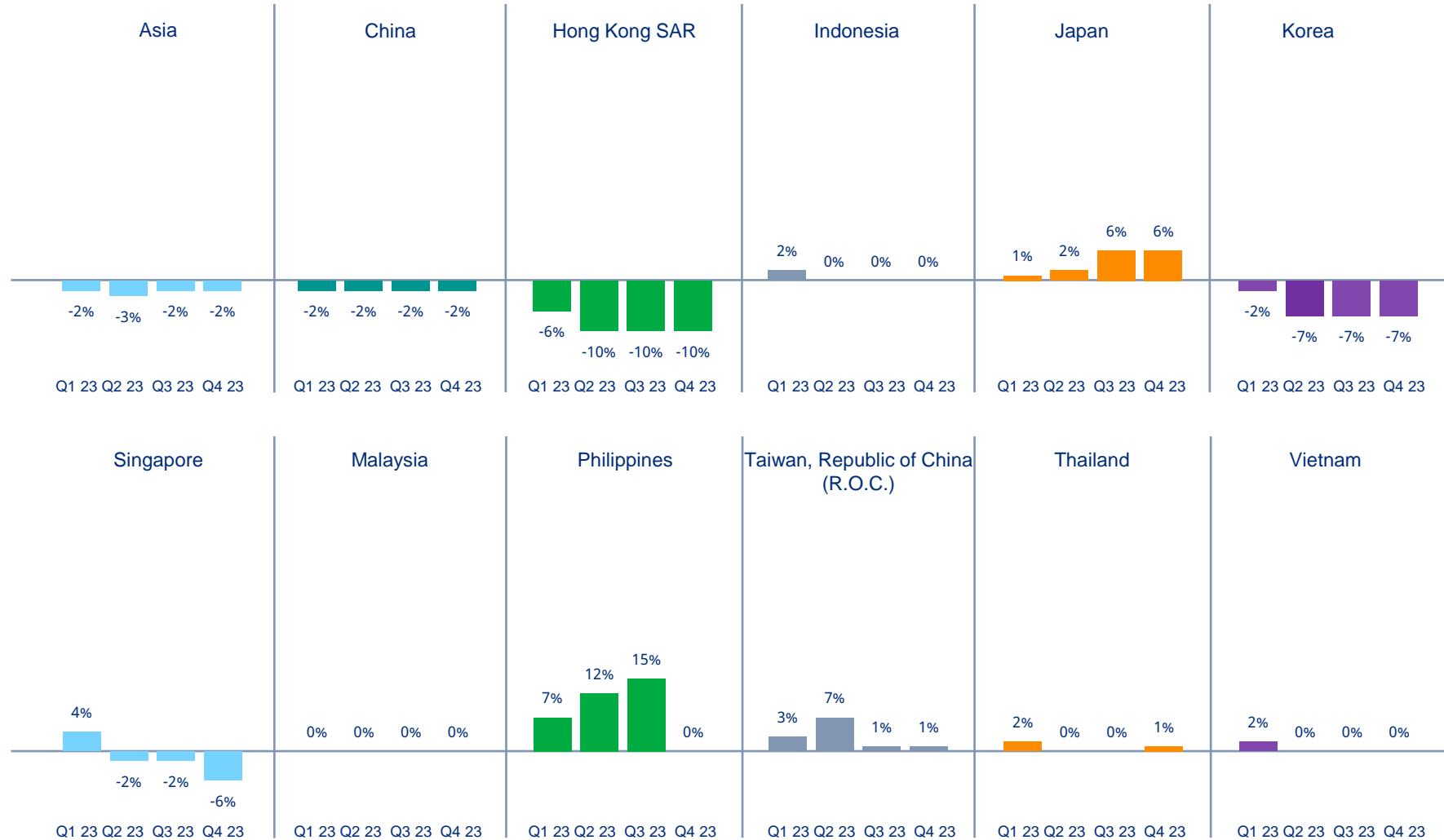
Figure 3| Asia casualty insurance pricing change by market

Casualty insurance rates declined 2%, the same as in the prior quarter.