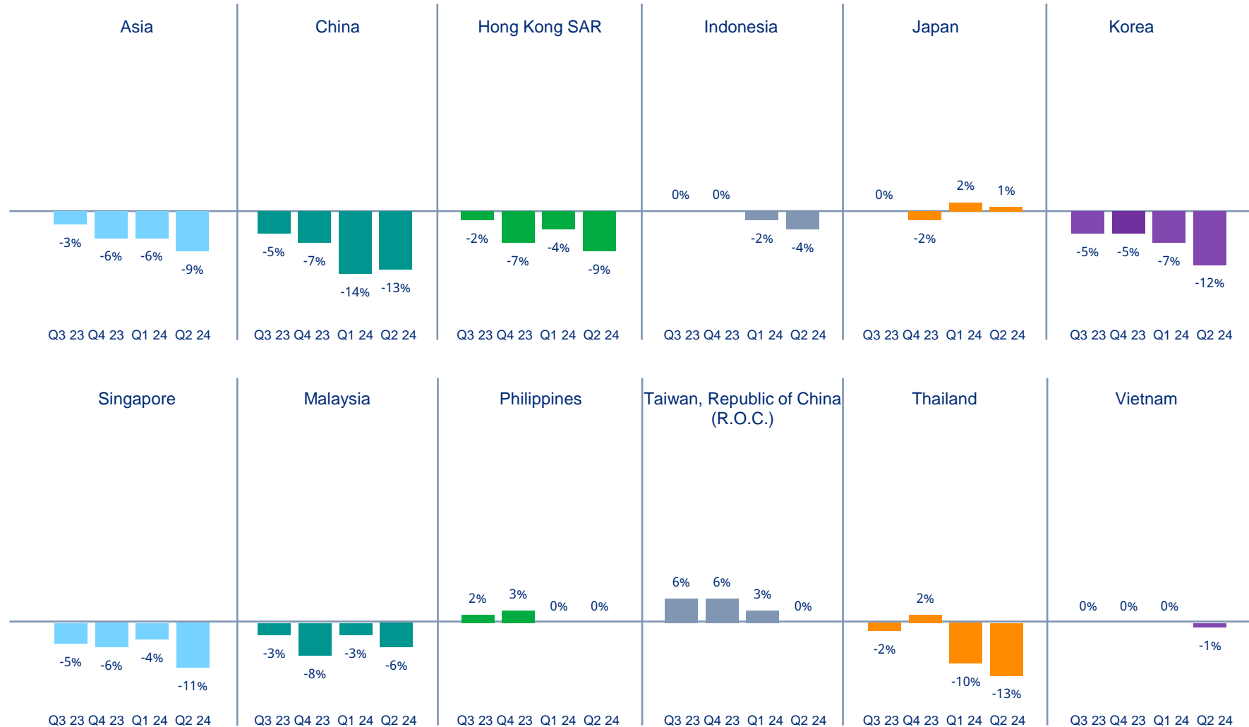
Figure 4| Asia financial and professional lines insurance pricing change by market