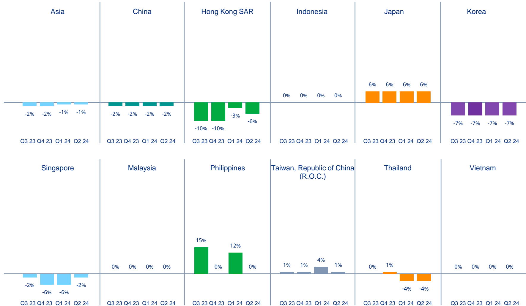
Figure 3| Asia casualty insurance pricing change by market