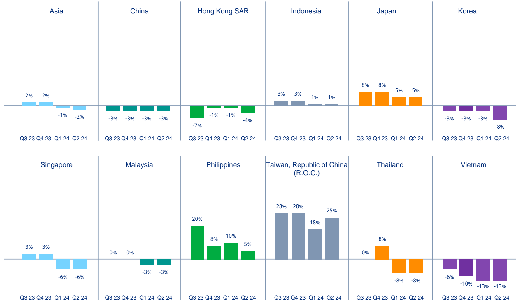
Figure 2| Asia property insurance pricing change by market