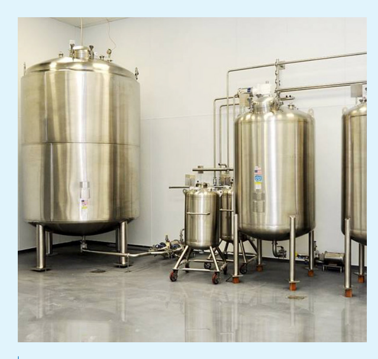
A typical bioprocessing suite uses large volumes of pure water for each production run

In sum, all "pure" water is not the same and appropriate for every application. The final product will dictate the type of water that is required from the start.