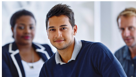
The Latino Factor Oct. 22