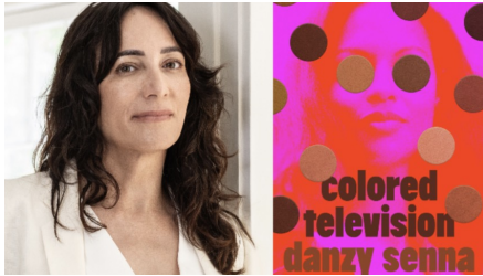
Beyond the Page with Danzy Senna* Oct. 9