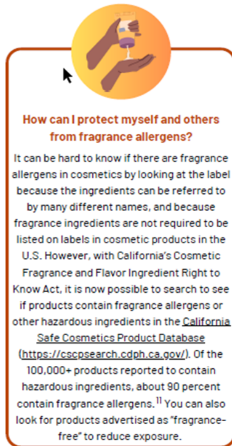
Image from CSCP's new "Fragrance Allergens in Cosmetics" fact sheet.

Thank you to our partners, CDPH leadership and legal counsel, safe cosmetics advocates, and industry leaders who contributed to these efforts. We look forward to sharing more achievements with you in the coming year.