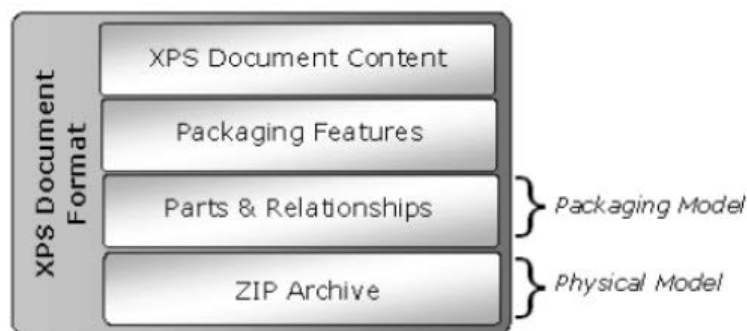
Figure 2: XPS Document Format

As depicted in Figure 2, the XPS Document format uses a ZIP archive for its physical model. Within the ZIP archive, the document is organized into different folders, each containing information regarding the document, such as relationships, resources, and content. Content files are stored in the document folder and are identified by the extension ".fpage." These files are written in XML and describe the content and properties of the pages.